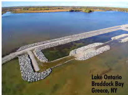
Lake Ontario Braddock Bay Greece, NY

Greece, NY borders Lake Ontario, Rochester's top attraction for both visitors and locals alike. Hundreds flock to the lake to partake in water sports, boating, sailing and to enjoy the sandy white beaches. Braddock Bay, home to many endangered rare birds is a source of pride for Greece residents. Greece is the closest business district to Lake Ontario for major grocery stores, national retailers and entertainment.