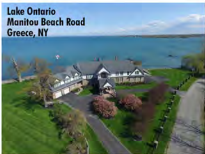
Lake Ontario Manitou Beach Road Greece, NY

Greece, NY borders Lake Ontario, Rochester's top attraction for both visitors and locals alike. Hundreds flock to the lake to partake in water sports, boating, sailing and to enjoy the sandy white beaches. Braddock Bay, home to many endangered rare birds is a source of pride for Greece residents. Greece is the closest business district to Lake Ontario for major grocery stores, national retailers and entertainment.